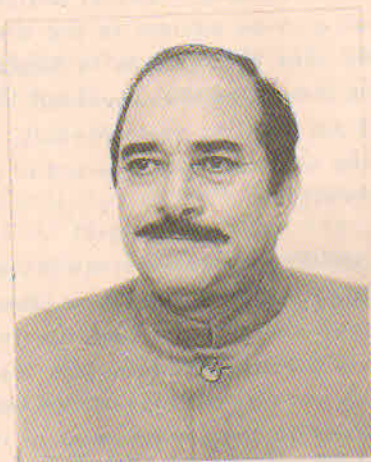
H.E. Lt. Gen. B.K.N. Chhibber (Retd.) Governor of Punjab